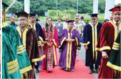
2nd\ Convocation\ Ceremony, 2022