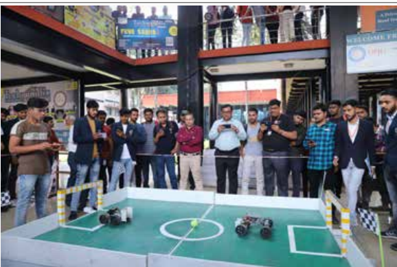
Technorollix 2022: Cultural & Technical exhibitions cum-shows (conducted every year)